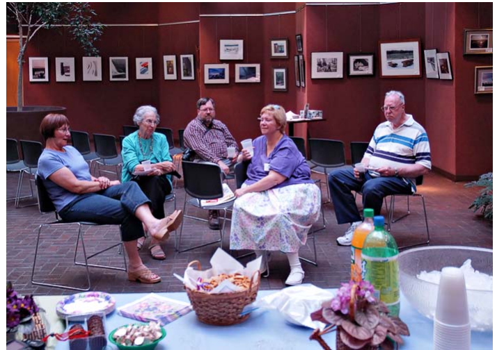
HCC members at Reception of our Greenbelt Photo Exhibit at Martin Luther King City Government Center on May 8, 2007.