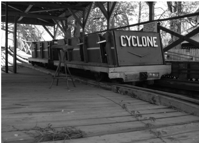
Cyclone Rollercoaster at Williams Grove.

Call 249-7610 or visit their web site at www.historicalsociety.com for more information and to see the museum virtual tour. Cumberland County Historical Society is located at 21 N. Pitt Street, in Carlisle Pennsylvania. Hours are Monday 3 to 9 pm, Tuesday through Friday 10 am to 4 pm and Saturday 10 am to 3 pm. Admission to the museum is free.